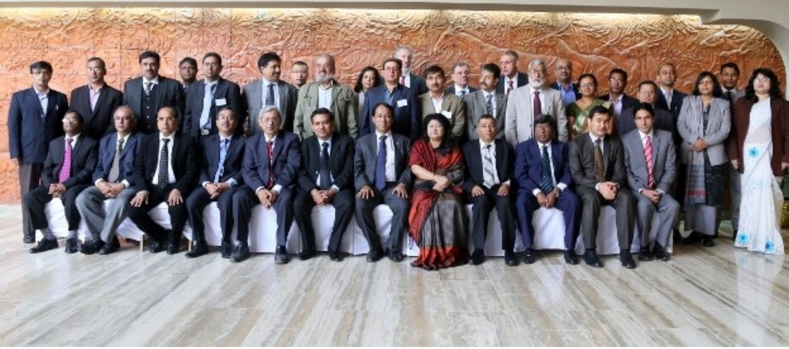
7th Inter Country Working Group Meeting