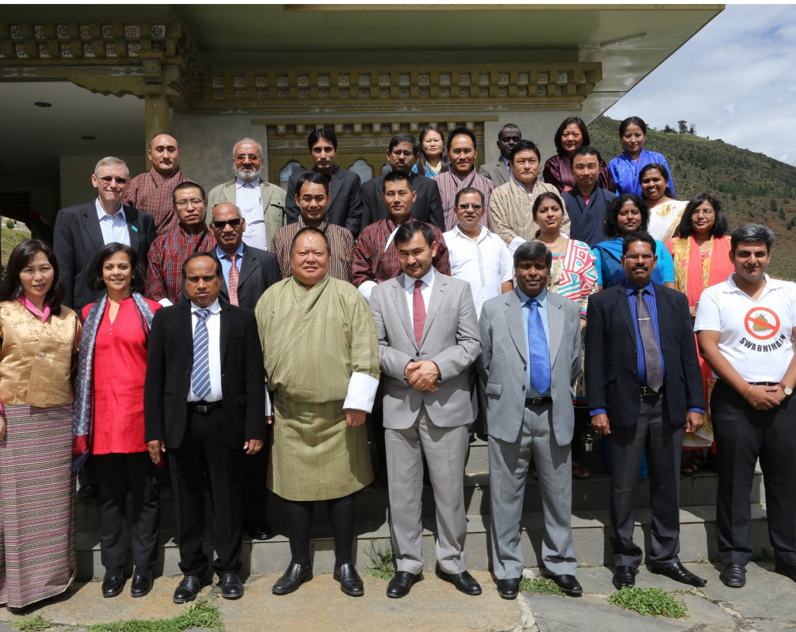
8th Inter Country Working Group Meeting