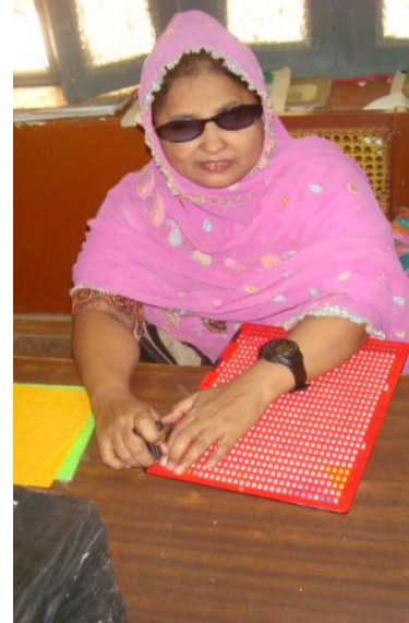
Visually impaired student – Hyderabad